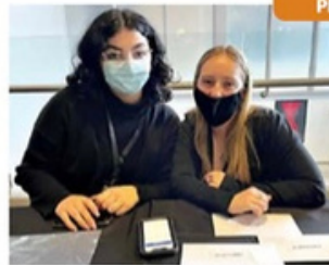
IT WAS all smiles at the premiere of locally filmed product Seven Times on Sunday, as Limerlight Cinemas hosted the event which also raised money for domestic violence support charity RiseUp.